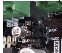
Position 1&2 = 5VDC