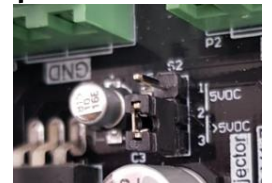
Position 2&3 = 12-24VDC